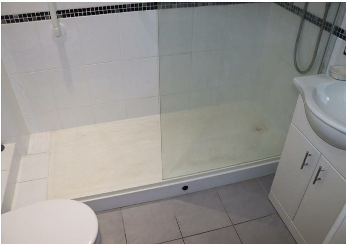
Modern Shower Room