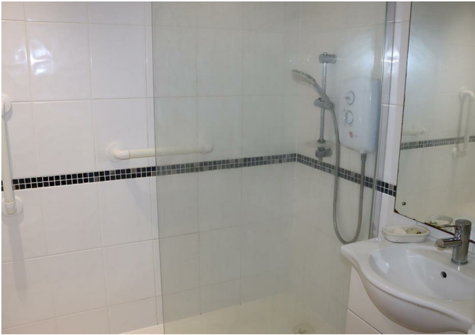
Modern Shower Room